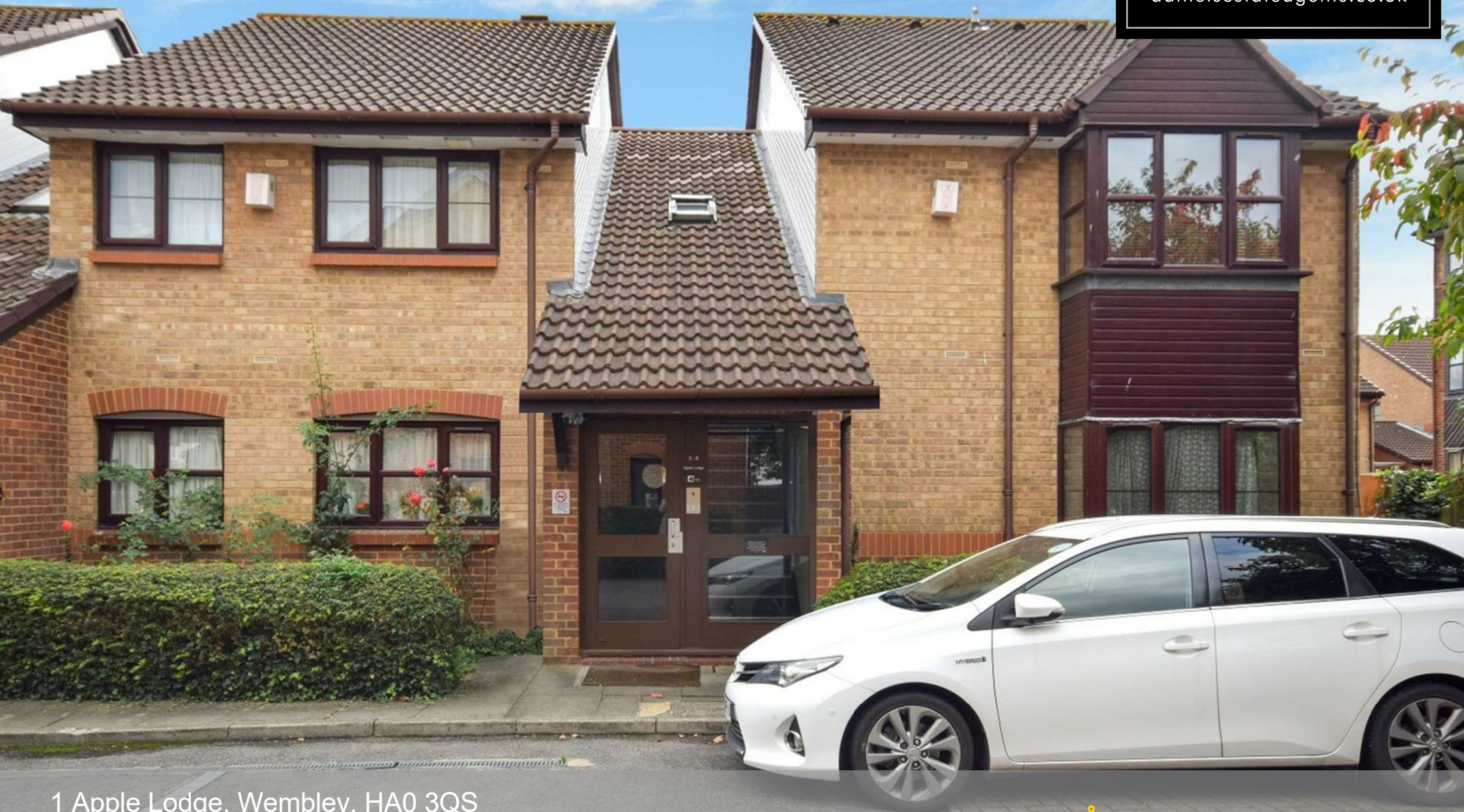
1 Apple Lodge, Wembley, HA0 3QS £240,000